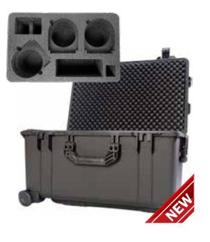
HC-800FS Water, Dust and Crush Resistant Case with foam compatible with PTC-280, PTC-140T and PTC-150TL - Trolley Style (XXL)